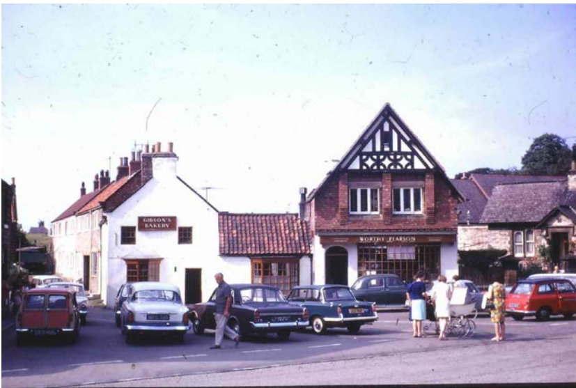
1960's – Worthy Pearson newsagent and Gibson Bakery