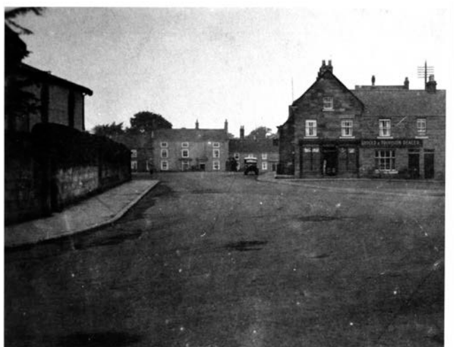
1930's – Coates Grocer & Provisions Dealer (Coopers Chemist located here in 2010)